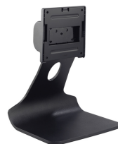
Desktop Stand P/N: ACC-008-44